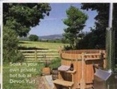
Soak in your own private hot tub at Devon Yurt