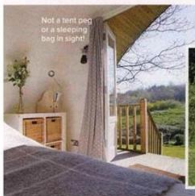
Not a tent peg or a sleeping bag in sight!

BOOK IT Four nights in Rose Cottage costs from £499; two nights in Swallow Barn costs from £425. To book, visit premiercottages.co.uk