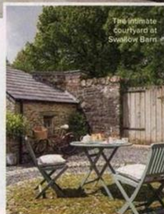
The intimate courtyard at Swallow Barn

features – inglenook fireplaces, stone walls and oak beams make the perfect backdrop for contemporary luxuries, such as the William Holland copper bath; or for a more romantic option, head to Swallow Barn on the edge of the Dartmoor National Park, a snug cottage just for two decorated in classic farmhouse style.