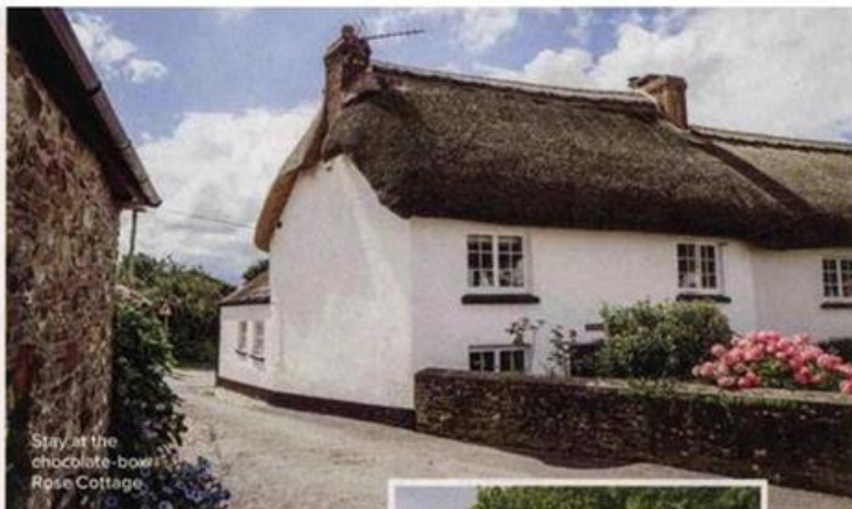
Stay at the chocolate-brown Rose Cottage

Towing all the kids to a hotel is often more stress than it's worth – hello holiday cottages! Often overlooked in favour of camping or B&Bs, a home-for-hire is the way to experience a destination like a local. Premier Cottages offers a range of stylish, cosy and quaint properties that allow guests to live out their Devon countryside fantasies. Our favourites are: Flear Farm Cottages in the South Hams – an idyllic farm complex with pretty boltholes, an indoor pool, animal petting and kids' play barn, all within easy reach of woodland walks and sandy beaches; Rose Cottage near Barnstaple, north Devon, an 18th century thatched two-bedroom dwelling bursting with period